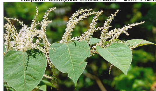
Japanese knotweed